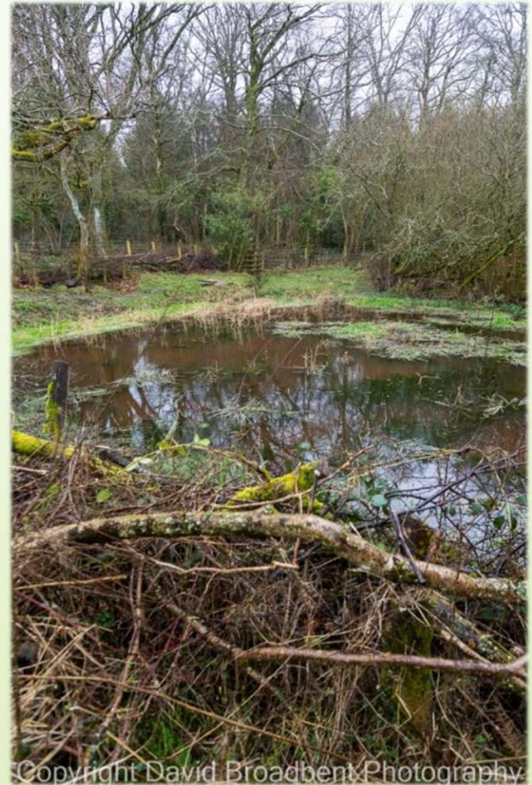
Wet Meadow Pond